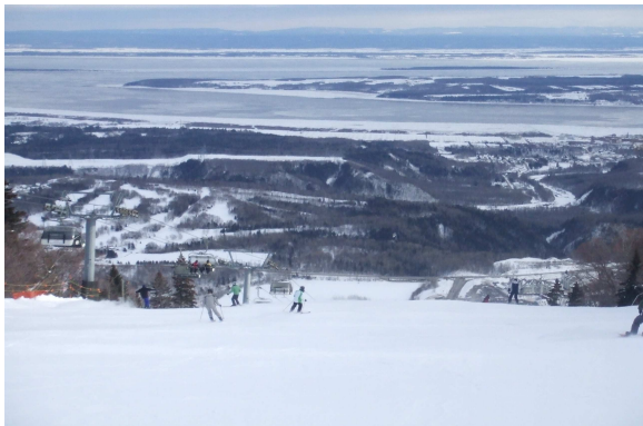
LE MASSIF...Friday Only