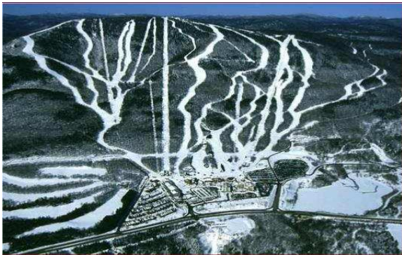
MONT SAINTE ANNE...All 3 Days